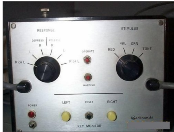
Hollywood tachistoscope control panel

used for one experimental film run, involving subliminal prompts to buy Coke and popcorn, but was not terribly successful. The Mercedes convertible was involved in a high speed accident and fireball just two months later. There were no survivors.